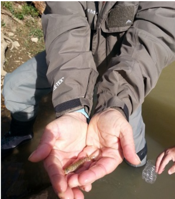
Spring fingerling release

Trout growth progress have been posted on the TIC Facebook page: https://www.facebook.com/groups/tulsaareatroutintheclassroom/