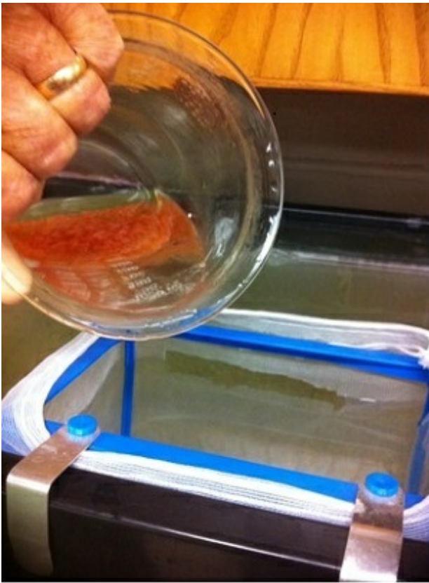
Trout Eggs Going Into Hatch Basket

By the time you are reading this over 3,000 trout eggs will have been placed into 14 Trout In the Classroom Tanks across the Tulsa area and children from 3rd Grade to Seniors in high schools will have been exposed to the lesson ... "If you take care of the water the trout will be fine."